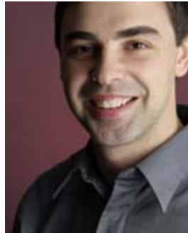
Larry Page - google