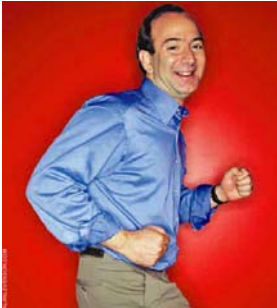
Jeff Bezos - amazon.com